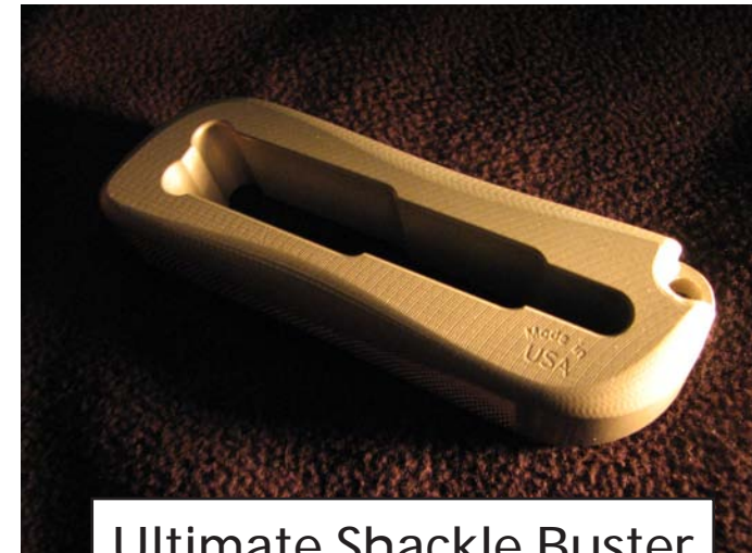
Ultimate Shackle Buster