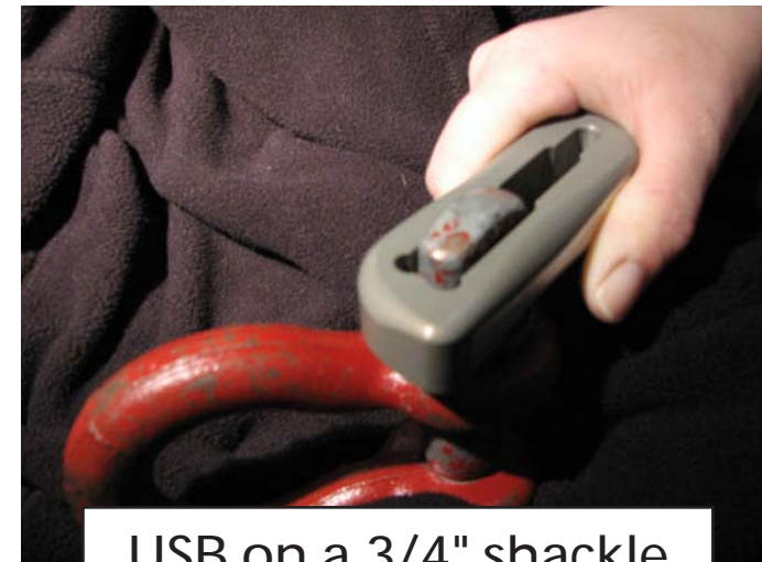
USB on a 3/4" shackle