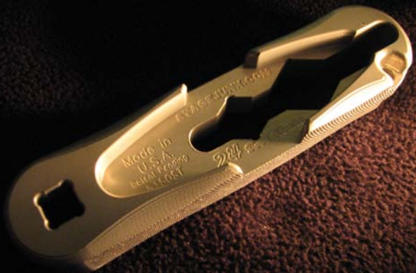
Standard Focus Tool - Bottom -