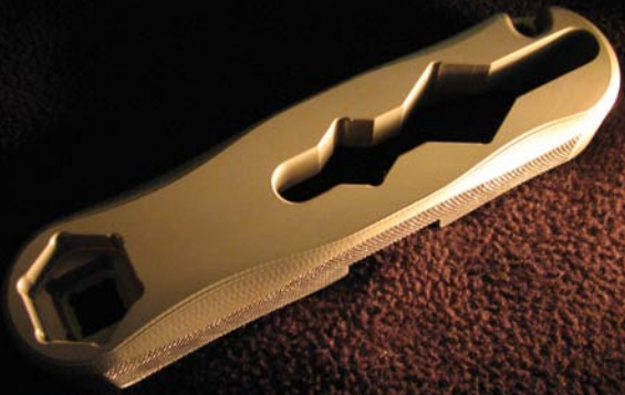
Standard Focus Tool -Top -