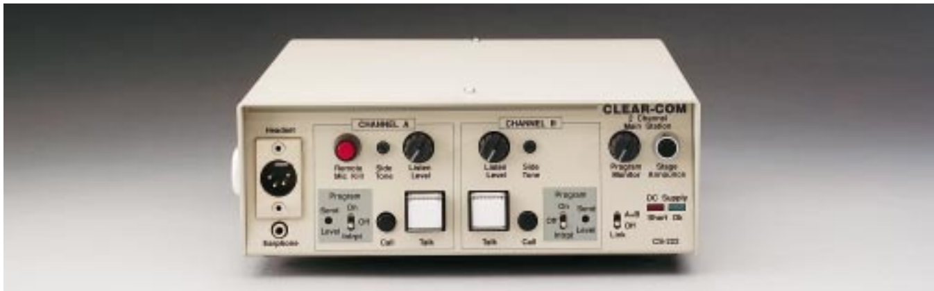
CS-222 Front Panel